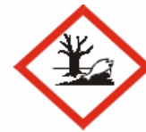
GHS 09- Environmental Hazards